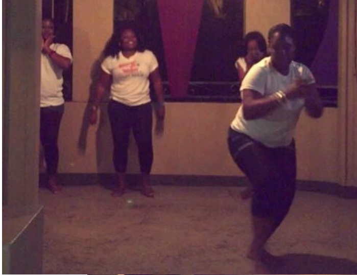
Ocho Rios' High Achievers get down to business and go through their paces